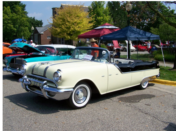
1955 Pontiac Star Chief Convertible