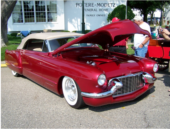
Roger Chesnut's custom Cadillac, best of show winner